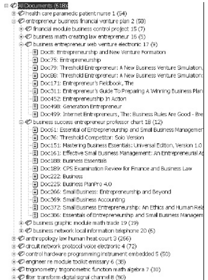
Figure 3 – Tree View for Data Set B

Fig. 4 shows the generated tree view for the Data Set 3, in which we can distinguish the categories of algebra & trigonometry, algorithms & programming, enterprise & trade programming, software engineering & CASE (Computer Aided Software Engineering), networks & protocols, web & commerce, graphics software and market & economics. In the directory “privacy network policy cryptography encryption” we can easily find the documents dealing with security documents. The titles of the documents further verify this.