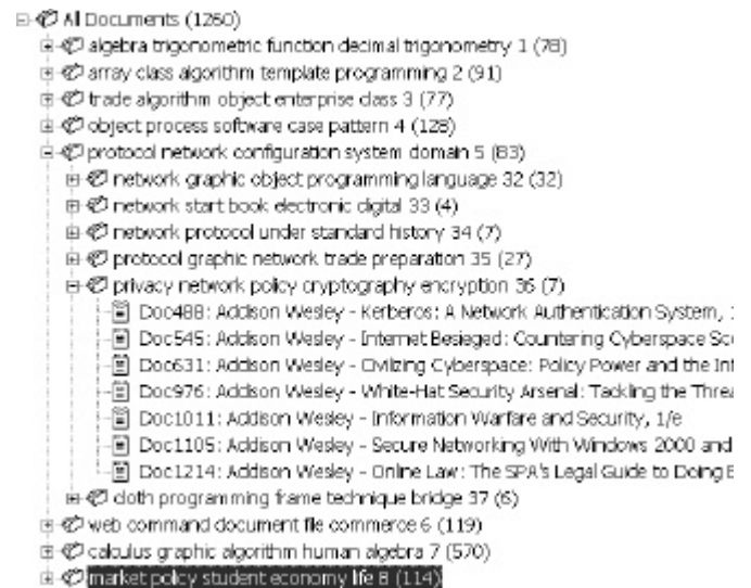
Figure 4 – Tree View for Data Set C